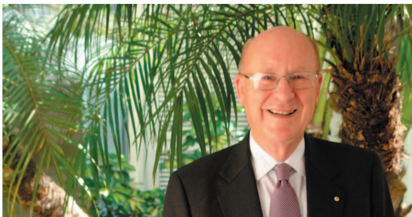
The Hon. Barry O'Keefe, AM, IACC Council Chairman

DAILY NEWS FROM THE 12 TH INTERNATIONAL ANTI-CORRUPTION CONFERENCE